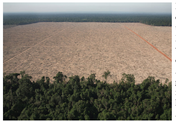
► Deforestation in Cambodia

EWMI's environment program is designed to work with local citizens to find sustainable and community-based solutions to urban and natural environmental conservation issues. In 2019, EWMI launched a new special initiative, Green Equity Asia, that works at the intersection of natural resources conservation, and community empowerment in the dynamic growth economies of Asia. Our initial priority is the Lower Mekong sub-region, a region of breathtaking biodiversity, conservation innovation, and mounting investment. EWMI's Open Development Initiative has also published and made available Environmental Impact Assessments (EIA) documentations across the ODM platform and these documents allow users to access information about