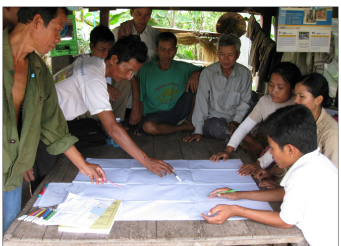
► Supporting community land documentation efforts.

Land conflicts and land rights violations continue to pose a challenge to the protection of human rights in Cambodia and throughout the lower Mekong region. EWMI has been working since 2001 to improve land tenure rights, supporting dispute resolution and strategic litigation, raising public awareness through radio series, story posters, and road show performances, and using ODM platforms as an unbiased and detailed comprehensive data source on land and natural resources. During this time, EWMI fostered a network of Party Assistants to advise and assist citizens in resolving their land disputes. EWMI also supported two community land documentation programs to help communities map, document, and preserve their land use and occupation history to help prove their ownership rights. EWMI supported human rights partners to provide