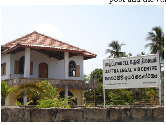
the breadth and quality of legal aid and develop innovative public awareness campaigns so that people understand their rights and how to exercise them. In Cambodia, through a legal defense fund, EWMI's legal aid partner represents constitutional rights defenders, including those charged with incitement, sometimes based on social media or private comments about COVID-19. EWMI helped produce a television series designed to educate Cambodians about their legal system at work, and provided extensive support to CSOs providing legal aid for the indigent. Additionally, EWMI facilitated the first "Legal Aid Leadership Forum," which provided a venue for the leaders of legal aid service providers to discuss common issues and problems. In

EWMI understands that a justice system is not just if it is beyond the reach of the poor and the vulnerable. An important part of EWMI's mission is to help expand