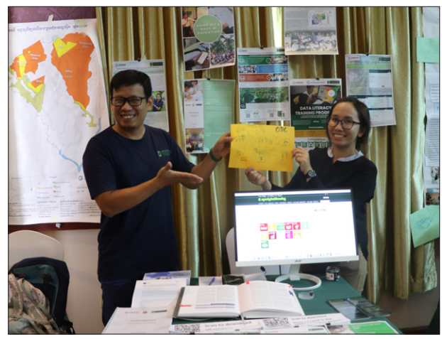
► The Cambodian Center for Human Rights used open source data on economic land concessions from Open Development Cambodia to support a report investigating land-related rights violations.

In 2018, OD4D's Asia Hub was launched to improve the availability and impact of open data in Southeast Asia and maximize it use in support of sustainable development. The hub aims to build a stronger community of practice in Southeast Asia comprised of open data technologists, civil society, government officials, donors, and researchers. With funding from the International Development Research Centre (IDRC), EWMI's Open Development Initiative